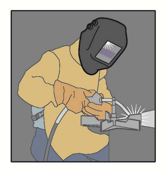
Figure 3: Welder wearing welding helmet, dry leather welding gloves and leather apron

In most cases PPE must be worn by workers when welding to supplement higher levels of controls such as ventilation systems or administrative controls (see Figure 3).