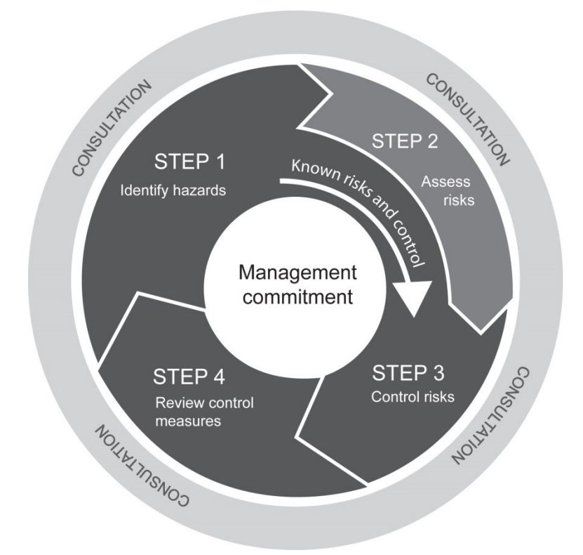
Figure 1 The risk management process

Many hazards and their associated risks are well known and have well established and accepted control measures. In these situations, the second step to formally assess the risk is unnecessary. If, after identifying a hazard, you already know the risk and how to control it effectively, you may simply implement the controls.